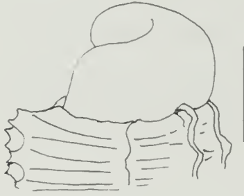
Fig. 2. Protoconch of F. paulmieri n.sp. Scale bar: 0.5 mm

Remarks. The subfamily Muricopsinae of the western Atlantic was revised by Vokes (1994), who commented, and illustrated both Recent and fossil species. Three Favartia species are worth to be compared with F. paulmieri n.sp.